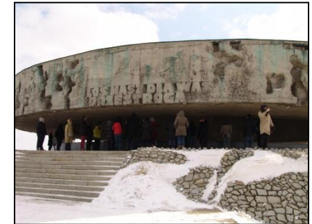
Majdanek Concentration Camp Memorial, Poland (2013)