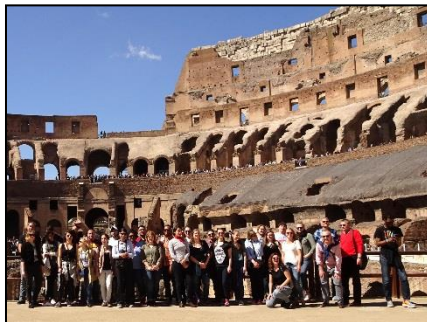
Inside the Roman Colosseum (2017)