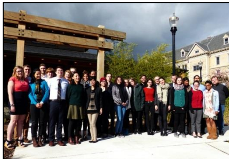
After the Symposium Conference at OSU (2016)

US Embassy, Poland (2011, since 2015) — American University in Bulgaria, Blagoevgrad (2015) — OSU Student Sustainability Initiative (2014) — Georgetown University (2005-2011) — European School of Governance, Berlin (2006) — Charles University Prague (2005) — ZEIT-Stiftung Ebelin und Gerd Bucerius (2005) — DAAD / German Academic Exchange Service (2004) — The European University, Viadrina (2005) — Bard College (2003-2004)