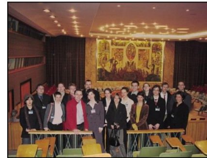
At the United Nations in New York (2004)