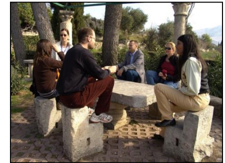
In the Ruins of Salona near Split, Croatia (2007)