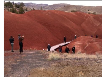
Painted Hills, John Day Fossil Beds, Oregon (2012)